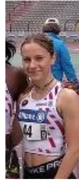
BRUSSELS GRAND PRIX