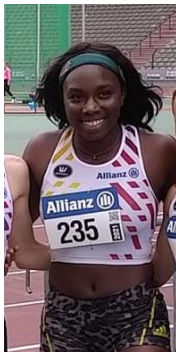
BRUSSELS GRAND PRIX